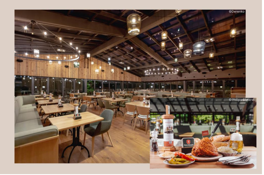
f.l. ©Derenko ©Philipp Lipiarski

This year's TRB ISFO participants can join a Networking dinner at Luftburg. This restaurant does not only serve everything from traditional Viennese cuisine to vegetarian and vegan dishes and drinks in 100% organic quality but is also located in the world famous "Wiener Prater" amusement park.